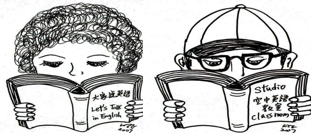
Covina Bethel English Class Newsweek

Covina Bethel English Class Englishclass4u@Englishclass4u.com Tel: (626) 332-8223 Studio Classroom Let's Talk in English Saturday, 9:00 am- 11:30 am Mar 7, 2009